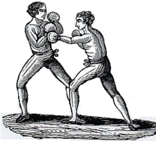
Defense of the Face and Pit of the Stomach.

In general, the legs should not be opened more than about half their extend, the left foremost, and the right at an easy distance behind. The knees should be a little bent, to afford you an opportunity of rising in giving your return; and the principal weight of your body placed on the foremost leg. This attitude is perhaps the best calculated for defence, the body being removed farther from the coming blow, and though the head seems a little in danger, the arms are in such a situation as to protect it.