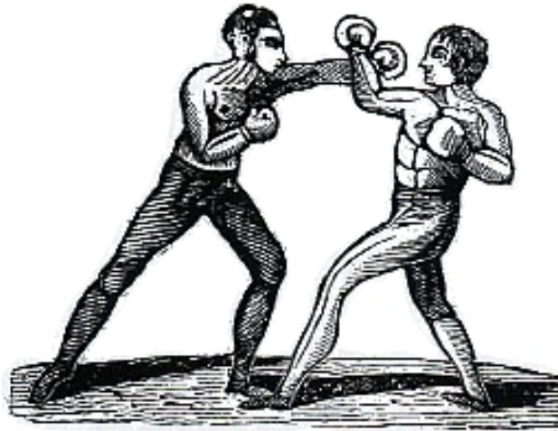
Parrying and Returning,

It will be impossible to take lessons of boxing, or to practise sparring, without suffering from the bruises which you will unavoidably receive on the arm, by stopping your friends blows, though struck ever so lightly. The best remedy in this case is the external application of brandy, which will give ease, and effect a speedy cure.